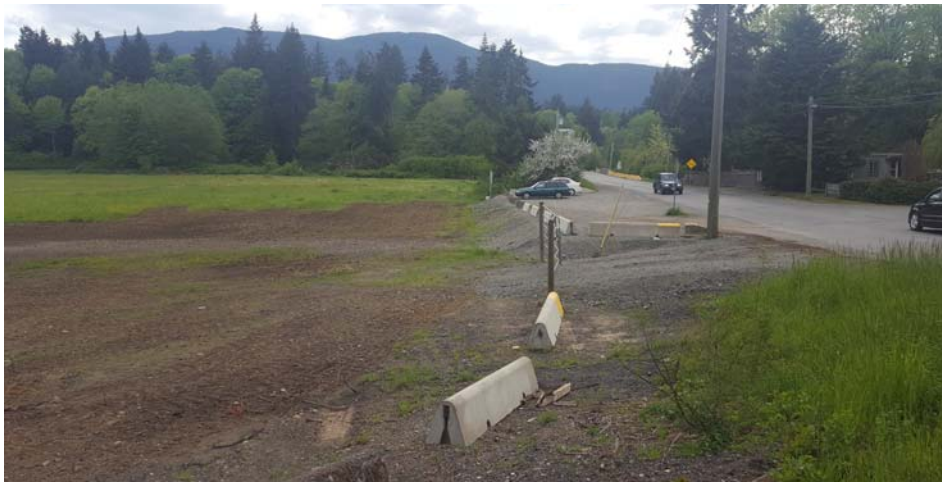
New parking area and park access off East Wellington Road. Parking area was created through utility upgrades in fall 2017.