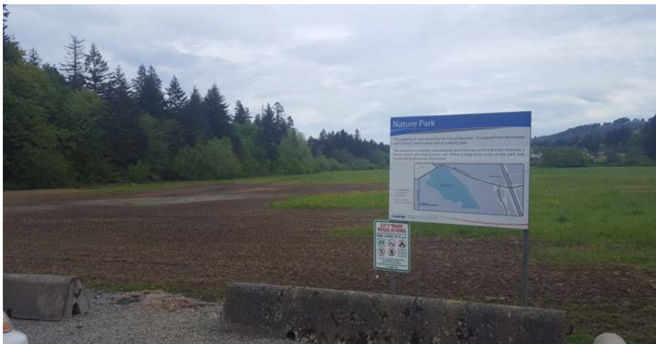
View of the entrance signage at East Wellington Park.