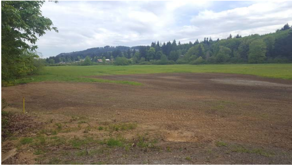
View across the open character of East Wellington Park (taken May 2018).