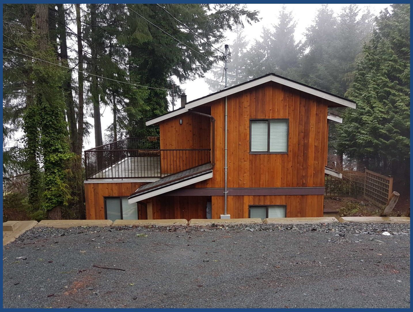
Parking area with no guard rail.