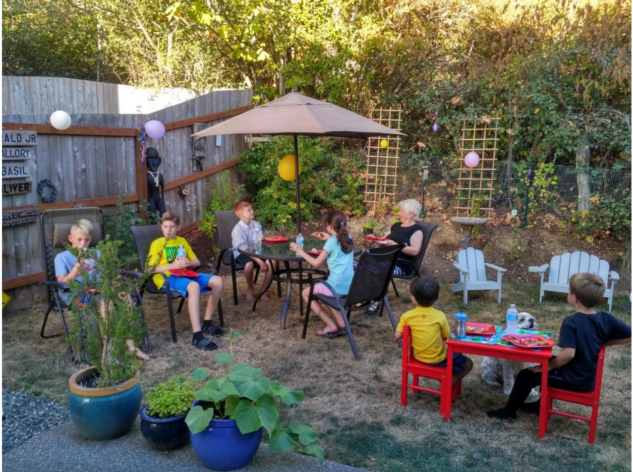
Back to school pizza night hosted by Shirley Gremyachev