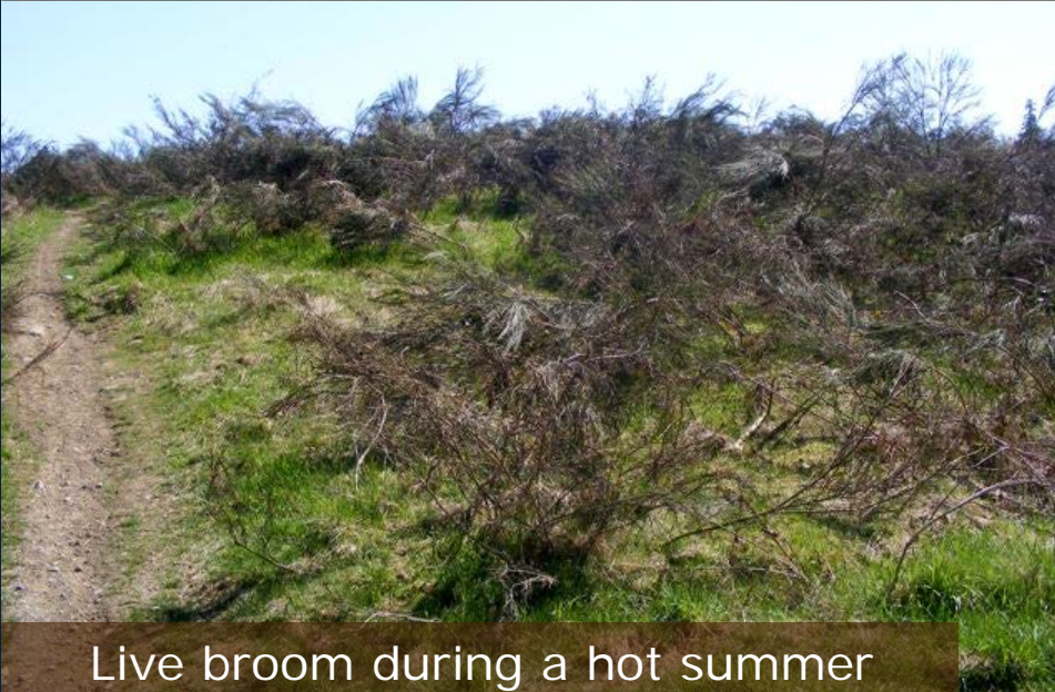
Live broom during a hot summer

Scotch Broom is a volatile flash fuel.. It will increase a wildfire's fuel load escalate the fire's intensity compromise fire situations make fires more difficult to fight."