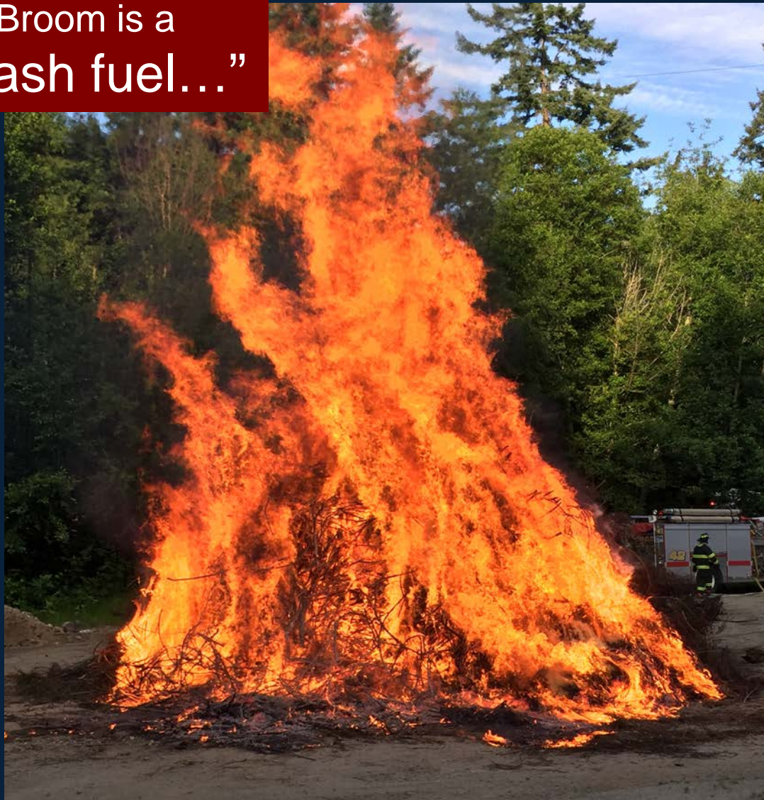
Photo of a controlled burn of Scotch Broom in Powell River Notice size of man in right corner.

"Scotch Broom is a volatile flash fuel..."