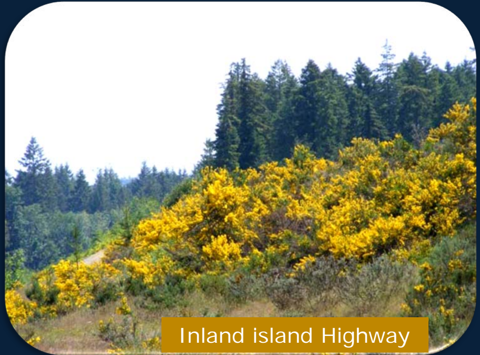
Inland island Highway