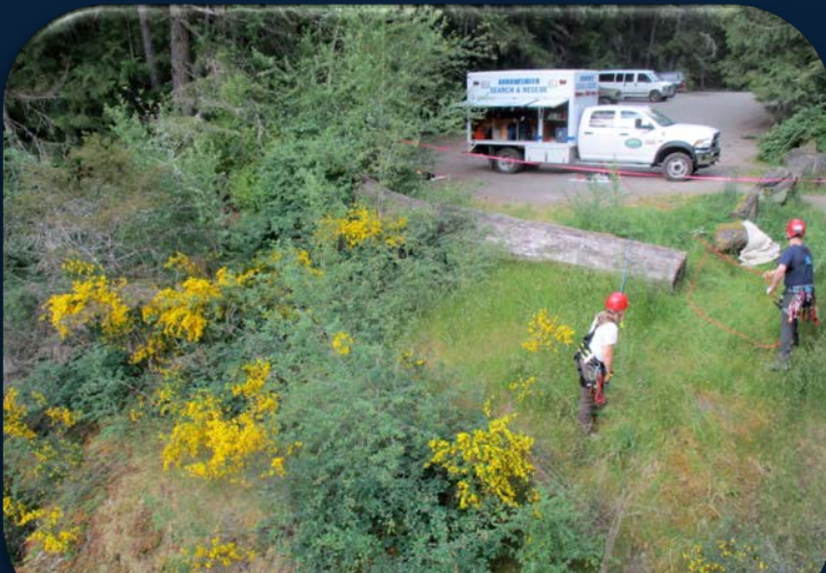
Search & Rescue at Top Bridge Regional Park