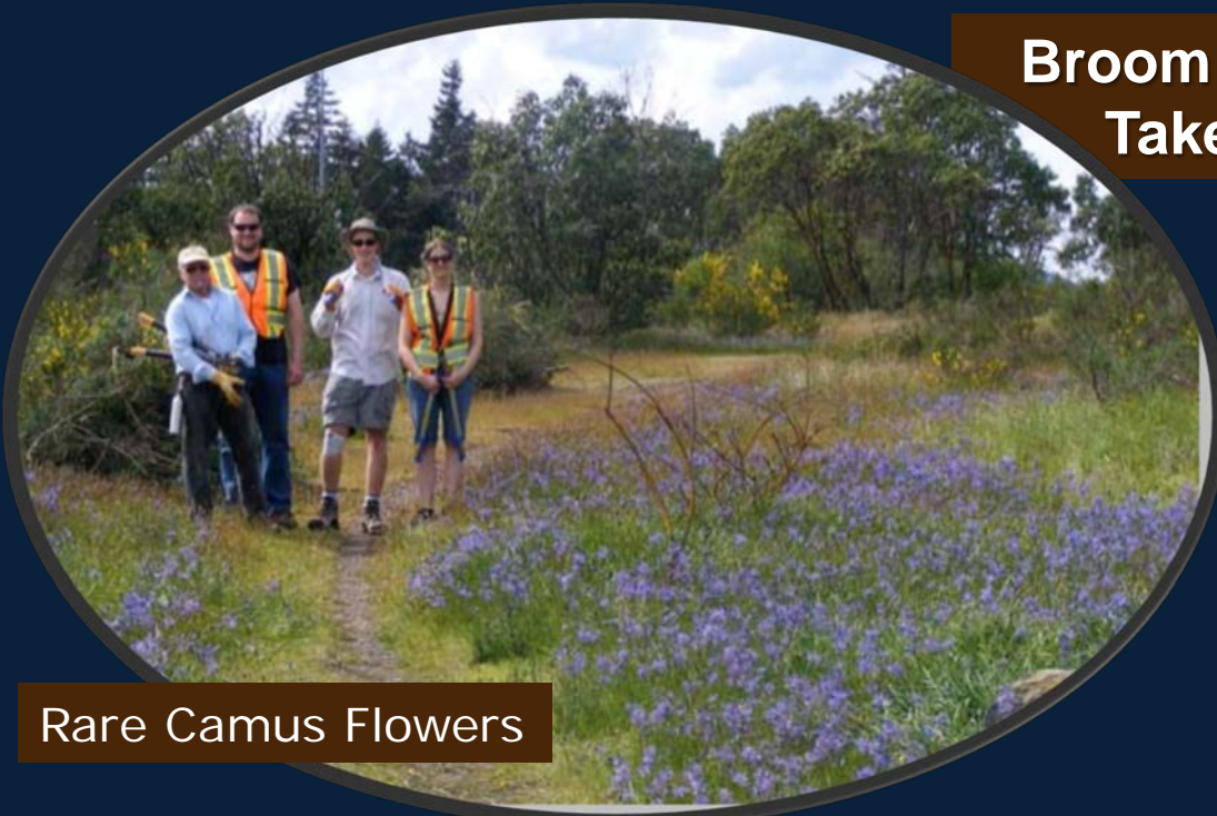
Rare Camus Flowers