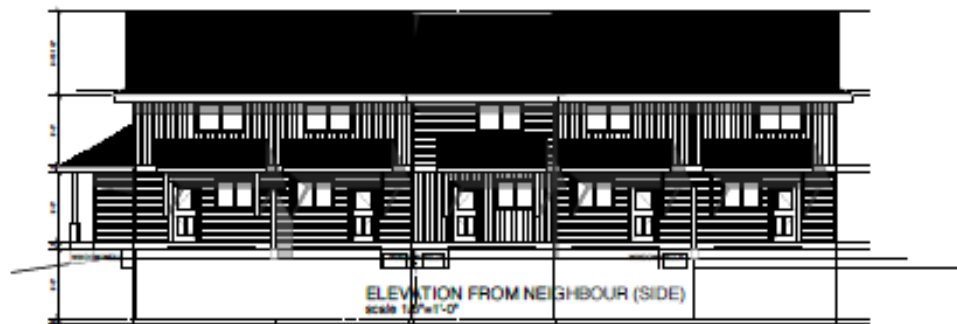
ELEVATION FROM NEIGHBOUR (SIDE) scale 1/8"=1'-0"