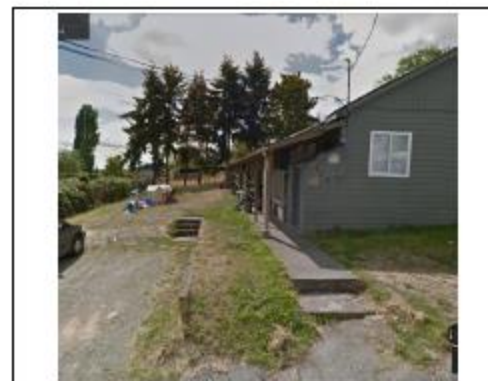
EXISTING SITE VIEWS