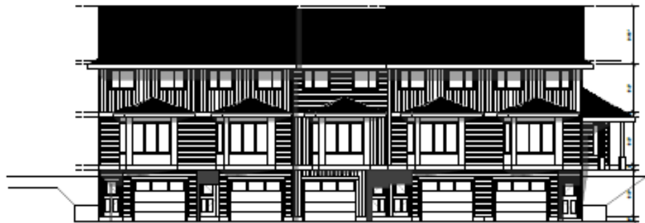
ELEVATION FROM DRIVEWAY (SIDE) scale 1/8"=1'-0"