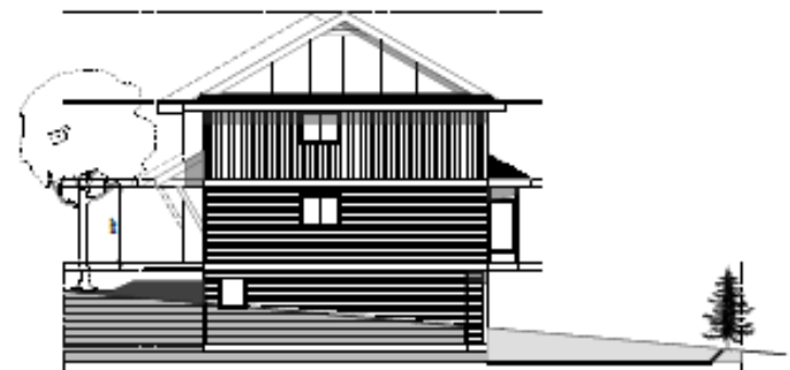
REAR ELEVATION scale 1/8"=1'-0"