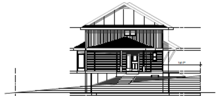
FRONT ELEVATION FROM SABISTON STREET scale 1/8"=1'-0"