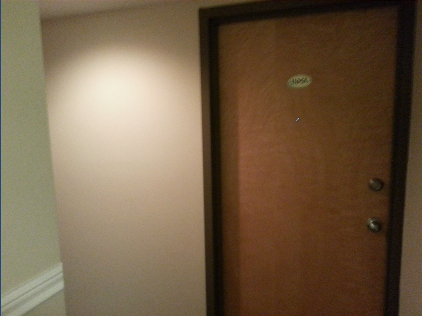
Signage for suites A & B on doors.